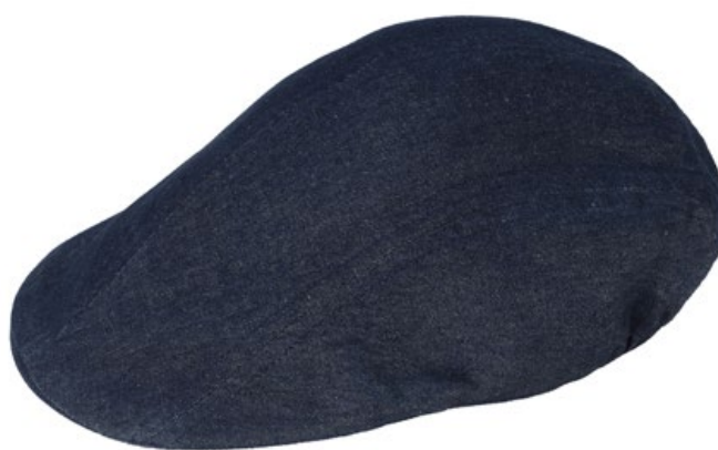
J32 Blue jeans