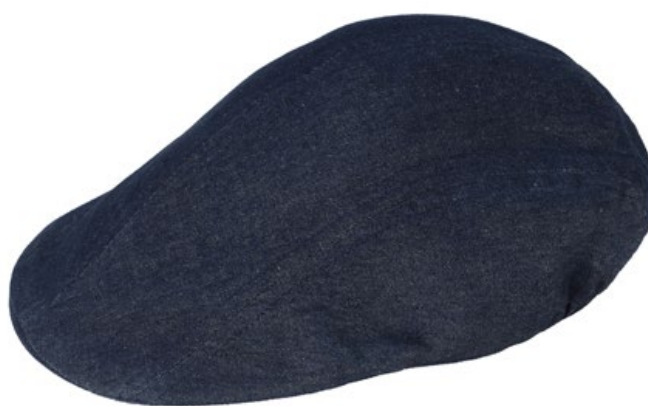
J48 Jeans blu