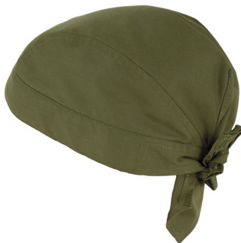
Z43 Verde militare