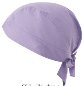
C07 Lilla chiaro