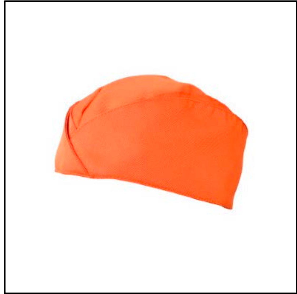
09 – ARANCIO