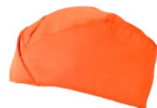
09 – ARANCIO