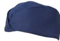
01 – BLU