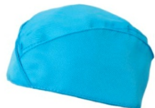
TR – TURCHESE