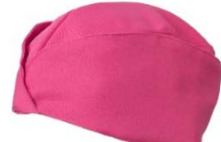
FX – FUXIA