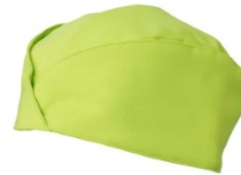
VT – VERDE ACIDO