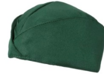
04 – VERDE