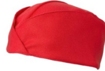
07 – ROSSO