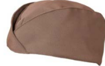
FF – CAFFE'