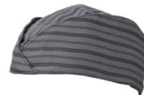
JT – GESSATO THAIT