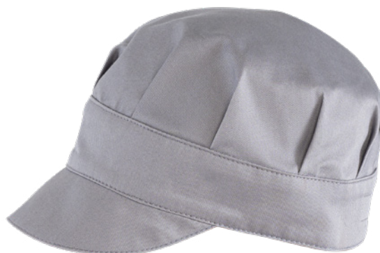
C02 Grigio chiaro