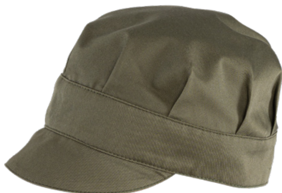
Z43 Verde militare