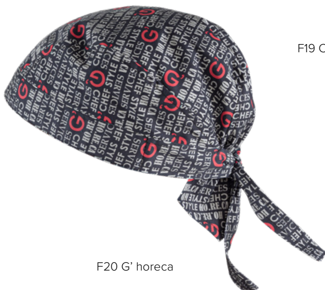
F20 G' horeca