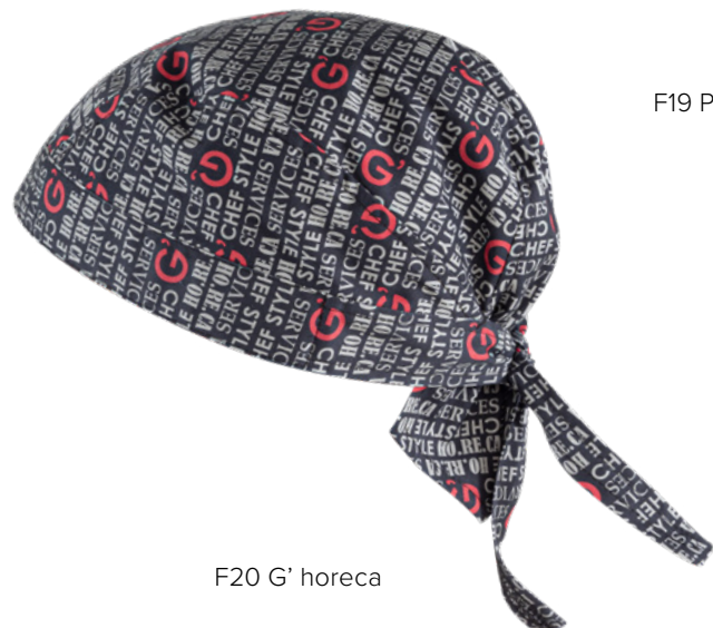
F20 G' horeca