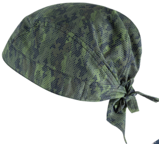
F19 Camouflage pixel