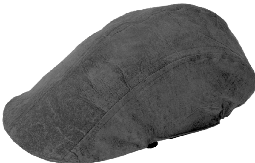
M12 Grigio medio