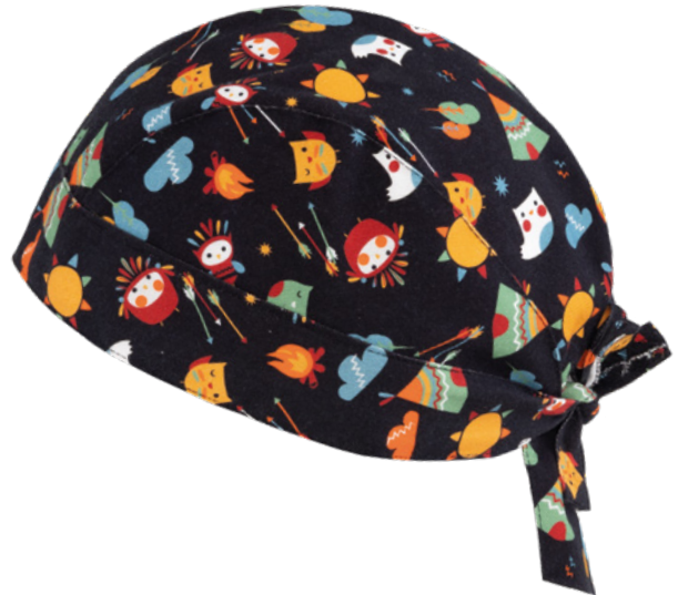
F13 Indian owls